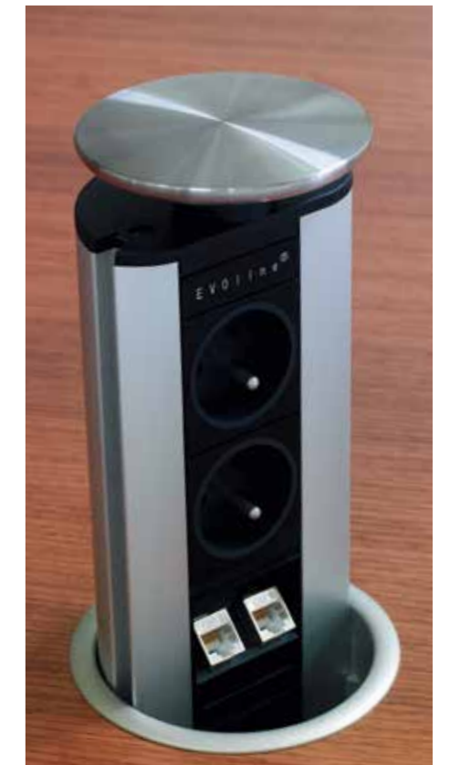
Vertically retractable power socket (Note: EU socket shown)

Walnut, oak, cherry, maple... veneers are selected carefully and are sourced from sustainably managed forests where the environment is respected and its renewal looked after.