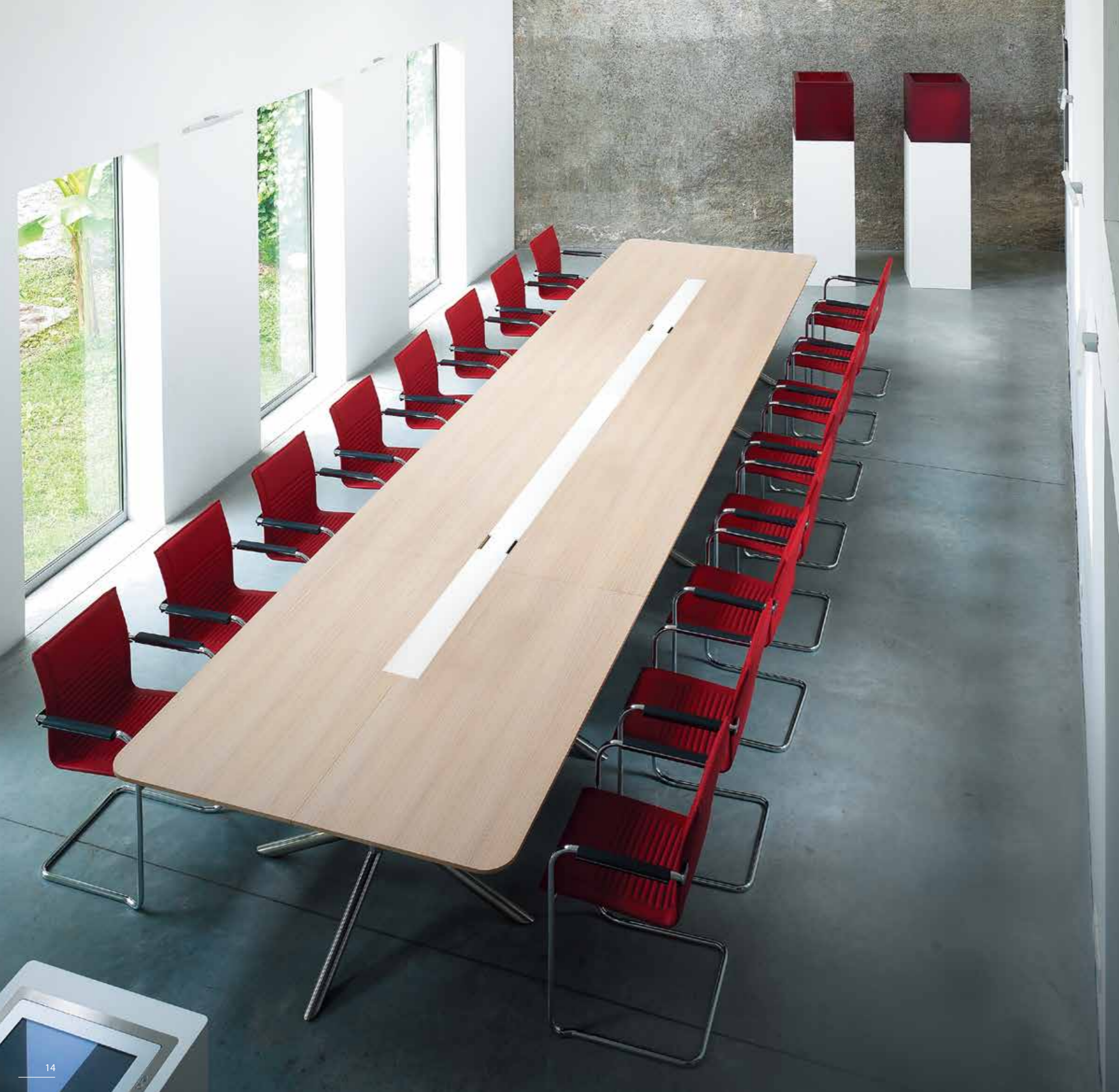
Long conferencing table catering for large team discussion.