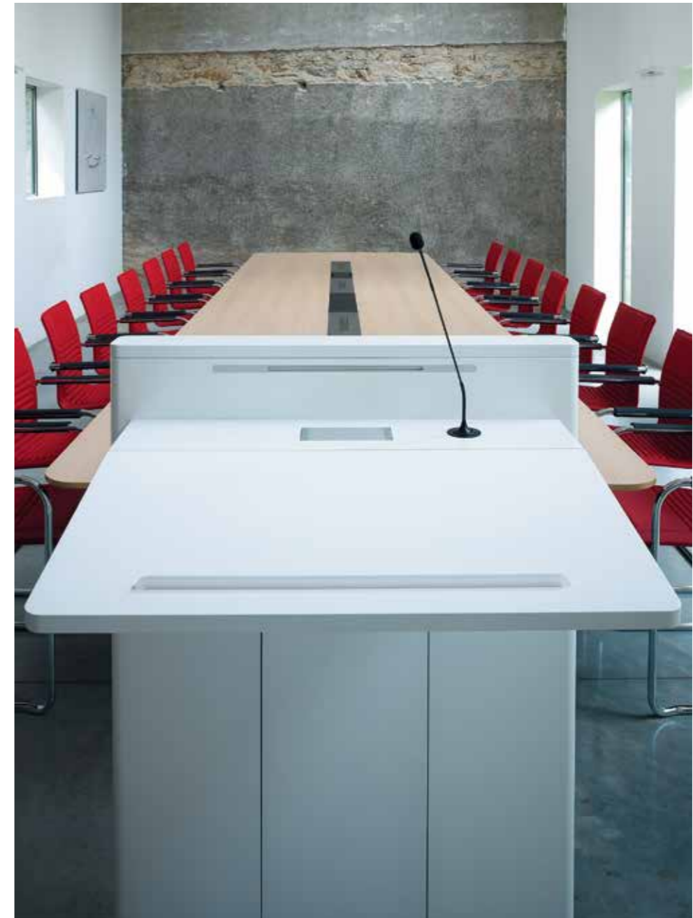
Lectern with integrated technology. The speaker doesn't have to take care of technical details but stays focused on his meeting.