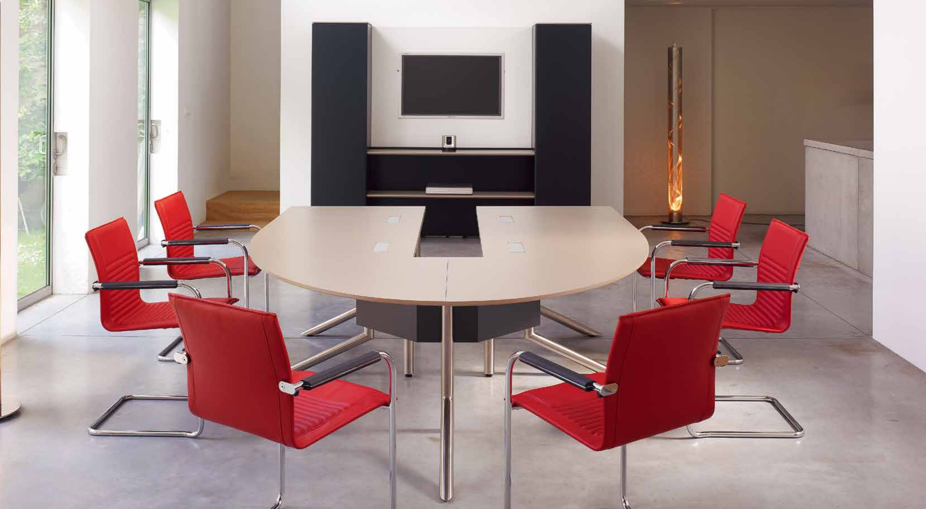
Videoconference – Bringing people together across challenging distances. Reducing business travel's impact on the environment.