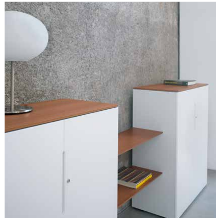
From storage to electrification, everything has been thought of to marry elegance and functionality.